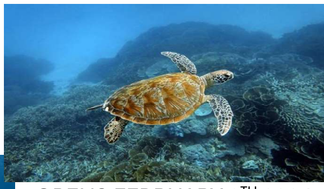
OPENS FEBRUARY 6<sup>TH</sup> 2024 $422/INCLUDING NITROX